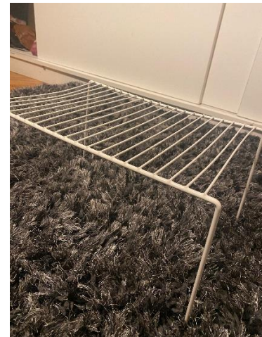
Laptop stand