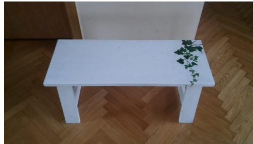
Bench made of painted wooden planks