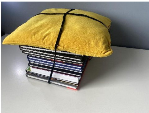
Footrest made of old books and a pillow