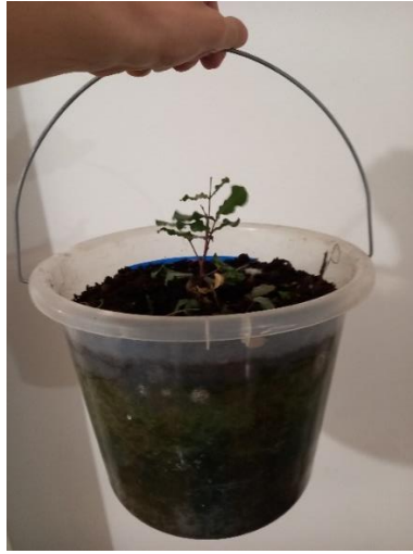
Plastic bucket reused to pot a plant