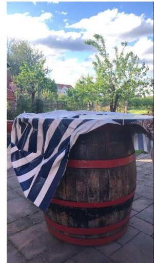
Old barrel reused as table