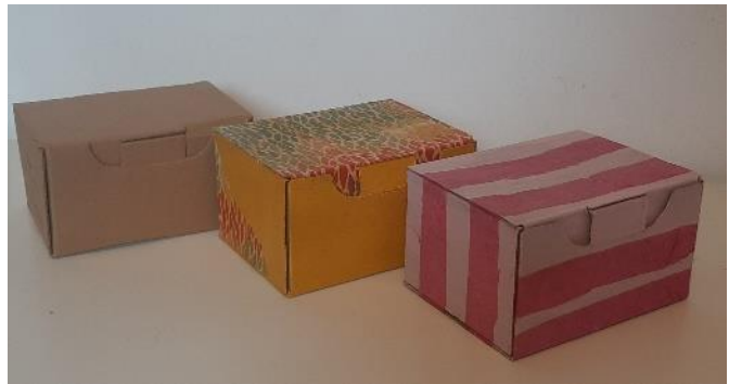
Reused decoupaged boxes