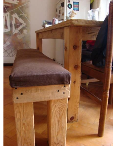
Bench made of leftover planks