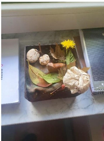
Plastic tray used for nature display