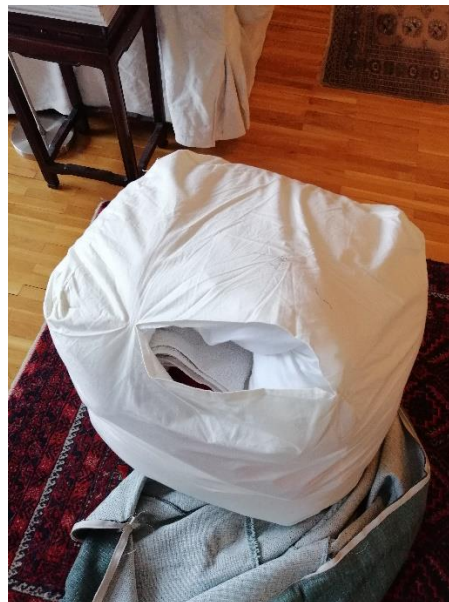
Teacher's example of footstool stuffed with old towels etc. instead of plastic filling