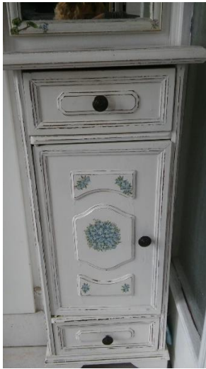
Repainted old furniture