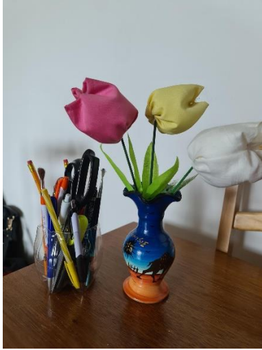
Flowers for a vase from old fabric and a pencil cup from a bottle