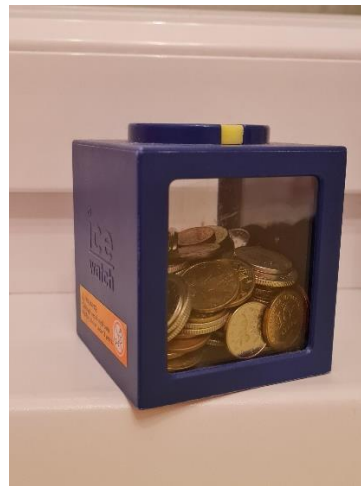
Old watchbox used as a money bank