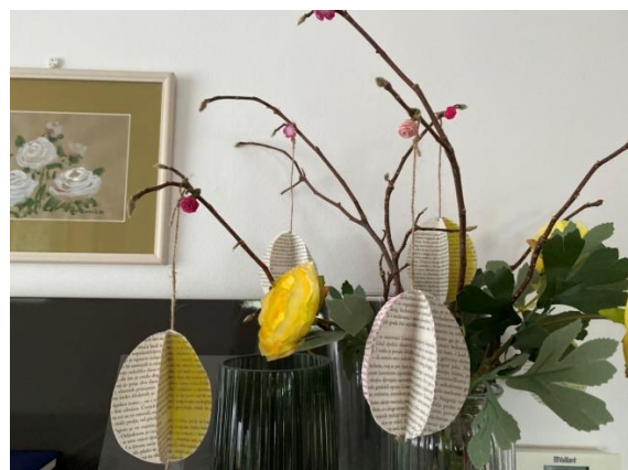
Easter decorations made out of an old book